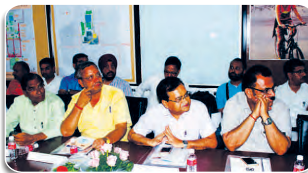
MD REIL during launch of Smart City Projects

On the occasion of 2 nd anniversary of Smart City Mission of Government of India , 12 Mega Projects including 2 Roof Top Solar Power plants of 100 kWp and 950 kWp capacity were installed by