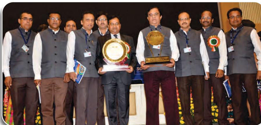
REIL Team at Award Ceremony at "Vigyan Bhawan"

The awards have been conceptualized and instituted to recognize the contribution & outstanding and exemplary persons in the management of Public Sector, for their hard work and leadership qualities. It may be noted that the SCOPE Awards are recognized as one of the most prestigious awards for public sector enterprises.