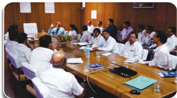
REIL officials during GST session