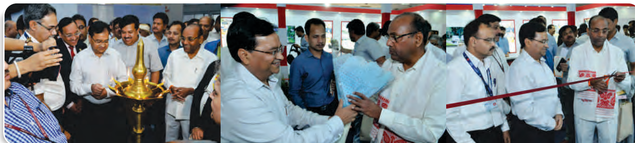
REIL stall being inaugurated by Hon'ble Minister MoHI&PE