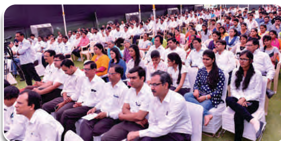
Glimpse of Annual Address