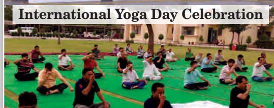
International Yoga Day Celebration