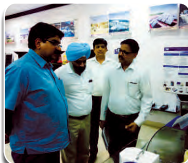
CEO PEDA and DGM PEDA being briefed about the products.