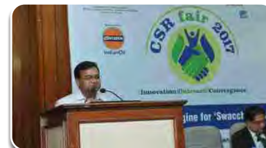
MD REIL during the session