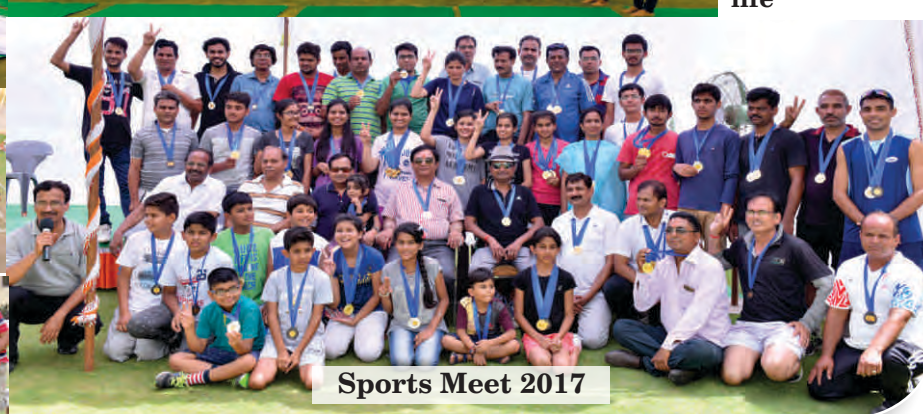
Sports Meet 2017