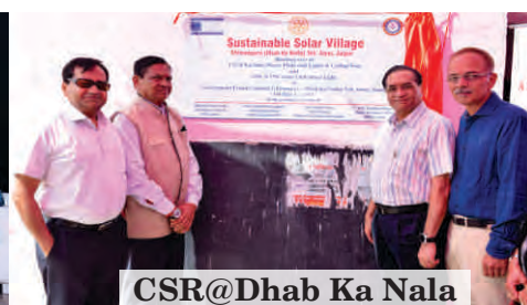
CSR@Dhab Ka Nala