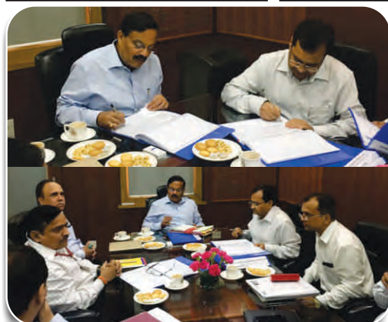
MoU Signing for the FY 2017-18

It was followed by an interactive session with employees wherein they took keen interest and shared their business aspects, ideas, future business vision etc.