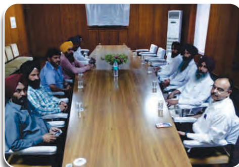
BoD and other officials of Verka Milk Union during their visit to REIL