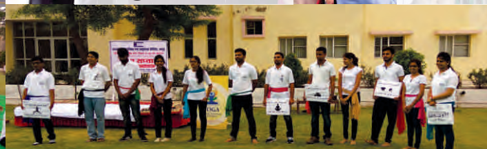
Nukkad Natak on "Importance of practicing Yoga in day to day life"