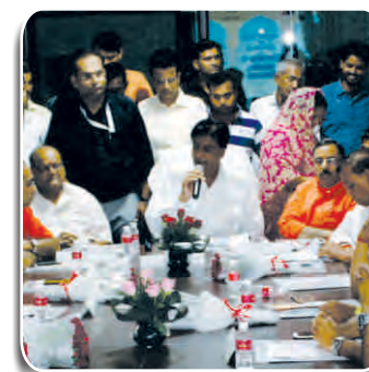
Housing and urban development Minister, Shri Shrichand Kriplani

Under PSU synergy , variety of SPV applications including SPV Power packs at Primary Health Centers in Rajasthan and LED Street Lighting systems have been deployed in far flung areas of Uttar Pradesh, Bihar, Jharkhand, Punjab and Rajasthan, thus ensuring safety and security in these areas and extended night life and business hours contributing to the socio-economic growth of rural masses.