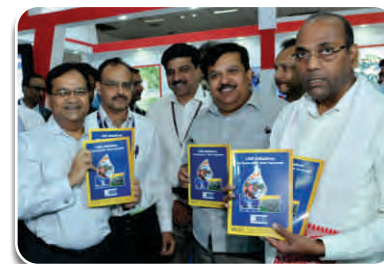
Releasing REIL booklet on CSR

MD REIL also addressed the session and shared his presentation & views on "CSR for Drinking Water and Sanitation for positioning India as Global Leader".